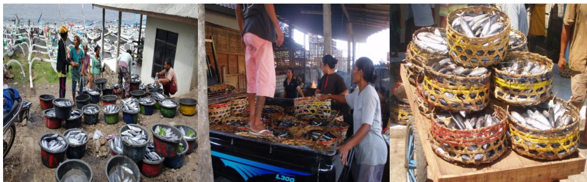
Figure 2. Transactions Process and frigate mackerel pickup

After arriving at the beach, the fish that is caught will be auctioned by the fishermen to the big traders who have been waiting.