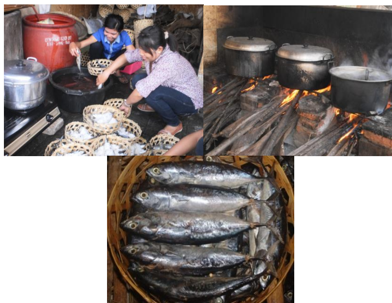
Figure 3. Process of salting, boiling, and frigate mackerel boiling

After the transaction is agreed between the big trader and the boiled fish maker then various equipment is prepared for the process of boiling fish. The equipment such as firewood and stove, large pots, bamboo baskets, while the other materials consist of fresh frigate mackerel, salt, and water for boiling and washing. The fish boil center in Kusamba is a place for processing fish to be boiled whose workers are mostly women.