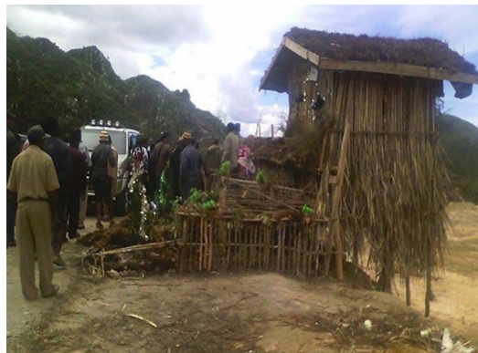
Figure 1. Christmas Hut on Mount Togokotu