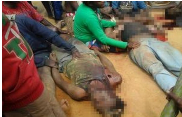
Figure 3. Civilian Shooting

Karel Gobay's square is close to Sub-Sector Military Command, Police Sector Office, and the East Paniai District Office, so the direction of stone-throwing in an uncontrollable situation leads to the offices. In response to the stone-throwing action, there were attempts to control the situation or to stop it forcibly by the Military-Police joint apparatus, so that the shooting occurred (Weruin, interview, January 20, 2022).