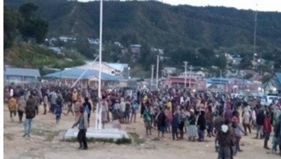
Figure 2. Demonstration of Paniai Society