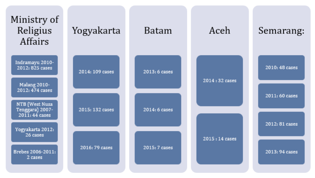
Figure 4 Data on Marriage Dispensation

Presidential Instruction No. 1 of 1991 on the Kumpulan Hukum Islam (KHI) Article 15 states that the age limit of marriage is the same as Article 7 of Law No. 1 of 1974, but with additional reasons: for the benefit of families and households.