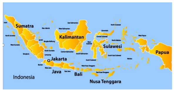
Figure 1<sup>1</sup> Indonesian Maps

Indonesia is a large nation located in Southeast Asia region. As a large nation, Indonesia consists of numerous islands consisting of Sumatra, Java, Kalimantan, Sulawesi, Papua and many more. In Indonesia, there is a huge diversity between one region and another in terms of ethnicity, culture, religion, and language. Even so, no problem arises since the