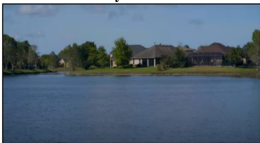
Figure 3.1 Scene 1 in Stay Home Save Live Advertisement