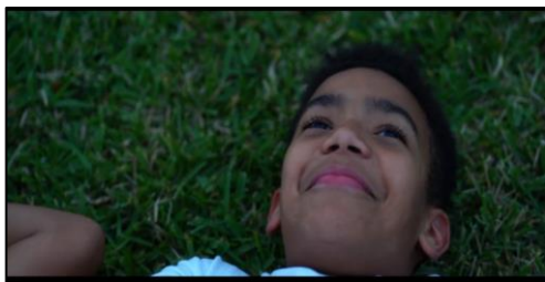
Figure 3.4 Scene 4 in Stay Home Save Live Advertisement