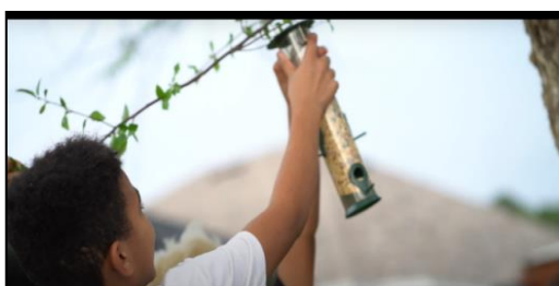
Figure 3.3 Scene 3 in Stay Home Save Live Advertisement