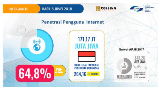
Figure 1. Penetration of Internet Use in 2018

In the era of Industrial Revolution 4.0, the mastery of technology is growing very rapidly. One of the most widely used technologies by the world community today to communicate and convey information is the internet. According to the Association of Indonesian Internet Service Providers ( Asosiasi Penyelenggara Jasa Internet Indonesia (APJII), 2019 ) internet usage in 2018 as stated in Figure 1.