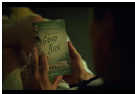
Figure 6. Tony Lip reading the Green Book (00:56:46).

The image above is of Tony Lip reading the Green Book to see a better route for his next tour. The Green Book or Negro Traveler is a black travel guidebook created in 1892 to 1960 by Victor Hugo Green, he was a black postman from New York. This book was published from 1936 to 1976 during the segregation era in the United States. The Green Book is not just a travel guidebook but also includes a list of various businesses such as restaurants, hotels, beauty salons and drugstores that are indispensable for the convenience of traveling in the United States for black people.