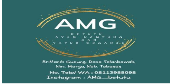
Chart 1Brand CV AMG Farm and Food Garden

The company engaged in goat farming and organic culinary business located in the banjar Manik Gunung area of Selanbawak Village, Marga District, Tabanan Regency, has been established about 3 years ago, most of which are individually owned. The company is a business entity called CV AMG Farm and Food Garden Banjar Manik Gunung Selanbawak Village Marga District Tabanan Regency. The company, which is engaged in goat farming and organic culinary business, has several benefits in addition to meeting human food needs according to the commodities produced by the goats, such as: meat for consumption, milk for soap making, goat skin for handicrafts, dung and urine that can be used for organic fertilizer and so on.