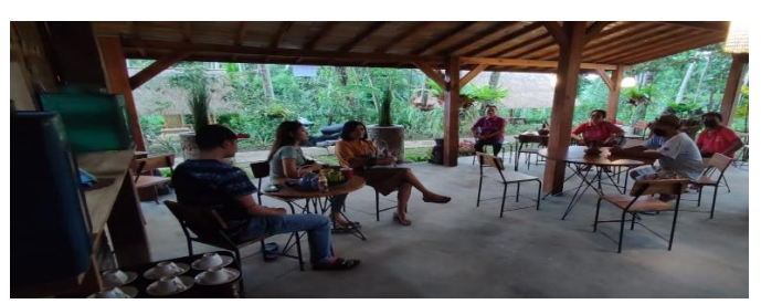
Figure 2 Organizing PKM

By looking at the factual conditions that exist in Selanbawak Village, it is hoped that in the future the community can manage goat farming businesses with organized management both in terms of maintenance, improving the quality of livestock trade and increasing the marketability of livestock, CV. AMG Farm And Food Garden, engaged in goat farming and organic culinary business in this case is widely developed on the island of Bali precisely in Banjar Manik Gunung Selanbawak Village, that most of the people who live in the village work in agriculture and plantations and one profession as an entrepreneur of goat farming and organic culinary business, which has fifty goats. This is what underlies our team to make the Selanbawak village community the target of conducting community service activities.