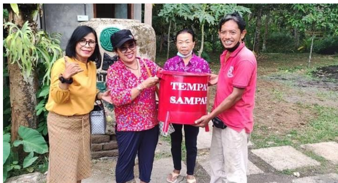
Figure 3. Donating Trash Cans