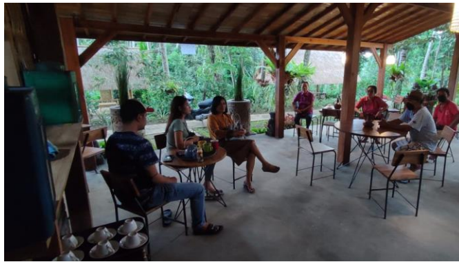
Figure 2 Conducting PKM Implementation