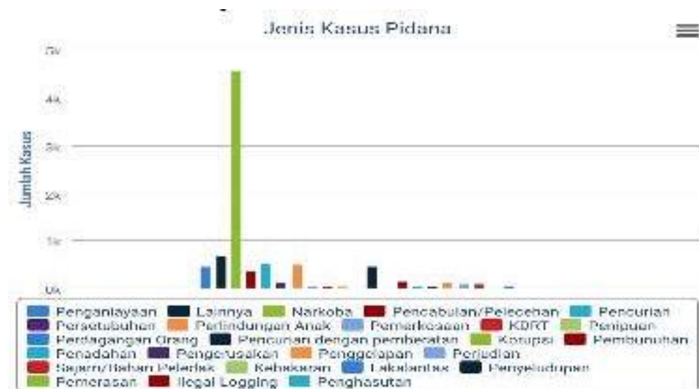
Figure.2 Types of Criminal Cases https://sidbankum.bphn.go.id/

Legal assistance, one of which can be done by paralegals. In general, the term paralegal is put forward based on the similarity of terminology in the medical world, namely paramedics. Paramedics themselves are parties who are not actually doctors, but understand the world of medicine and health sciences. The term paralegal itself was first recognized in the United States in 1968 with the role of a legal assistant whose function is to help a person