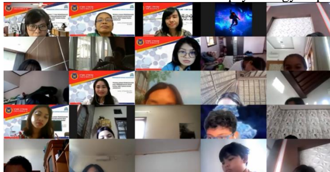
Picture 1. Opening Speech by Principle of Taman Rama Jimbaran Junior High School

Below are the pictures of the first session about the consultation on psychology impact of bullying: